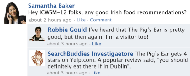
Figure 4. An example of how socially embedded search engines could be used to post supplementary information in addition to answering questions directly.

The conversational nature of the environment in which socially embedded search engines operate presents the opportunity for these search engines to engage users in new modes of interaction. For example, in the case when available contextual information is insufficient for an algorithm to effectively contribute, socially embedded search engines could ask for feedback and iterate. If a user inquires about a good place to experience traditional Irish cuisine in Dublin, a system like SearchBuddies might ask, “Are you looking something cheap or expensive?” Explicit user feedback has the potential to drastically improve result quality, but in practice search engine users rarely provide such information (Anick 2003). In contrast, clarifying dialog is common for conversational questions.