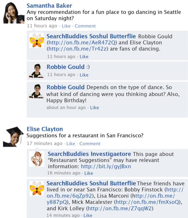
Figure 3a (top) and 3b (bottom). Two Social Butterfly responses.